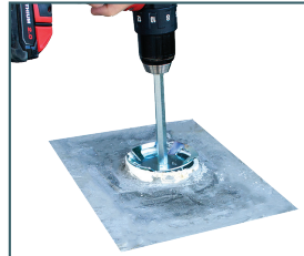
Use a Socket saver or inside pipe cutter to cut the pipe a 1/4 inch below the floor.