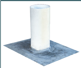
Pour the concrete around the stub out that remains above the floor level.