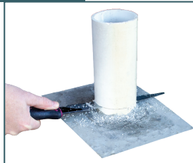
Cut the stub out as close to level with the floor as possible.