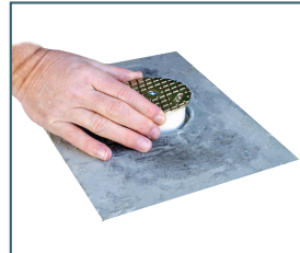
Apply primer and glue to the inside pipe fit cleanout and inside of the pipe. Insert the cleanout.