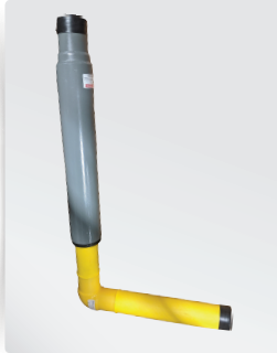
Inlet PE x MIP Steel Outlet