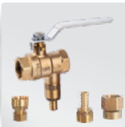
FITTING 3/8" COMP. FITTING 3/8" BARB FITTING 1/2" FIP