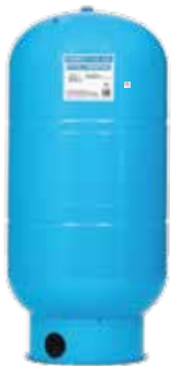
120 GAL. MODEL (HPWT120)