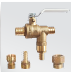
FITTING 3/8" COMP. FITTING 3/8" BARB FITTING 1/2" FIP