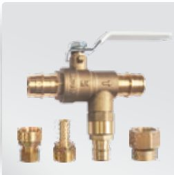
FITTING 3/8" COMP. FITTING 3/8" BARB FITTING 1/2" FIP