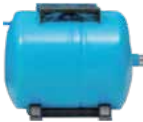
6 GAL. & 20 GAL. HORIZONTAL MODELS (HPWT6H & HPWT20H)